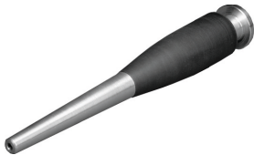
PRRIV1 Rivet Tool