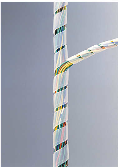
CP Transparent Spiral Flexi-