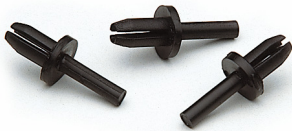
RIV1 6.5mm Rivet